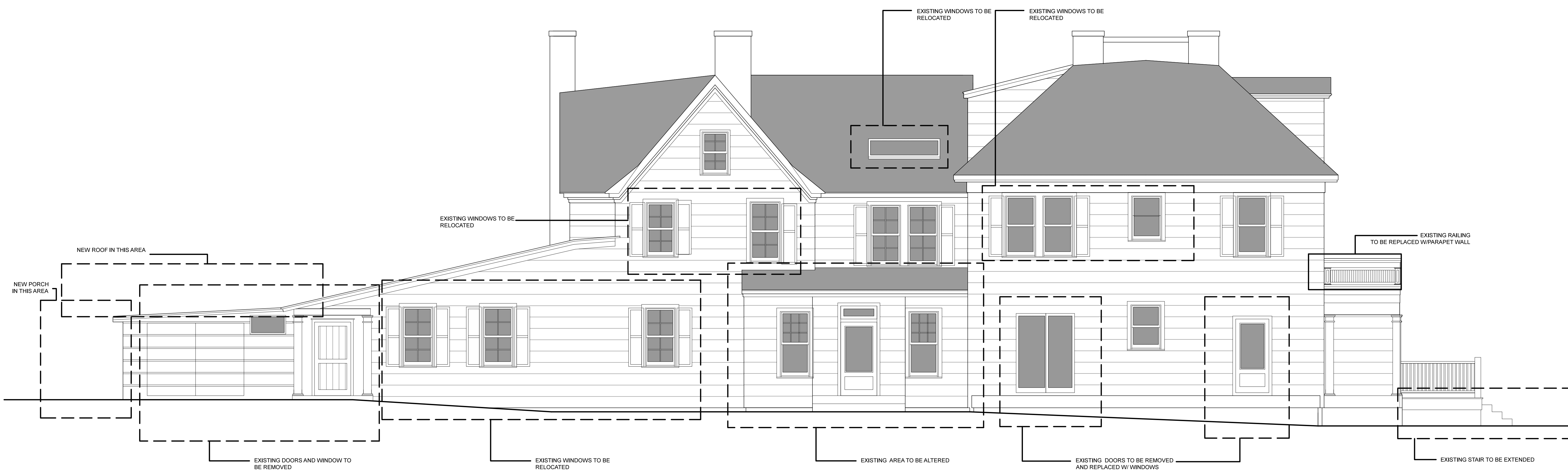
EXISTING WEST ELEVATION SCALE: 1/4" = 1'-0"