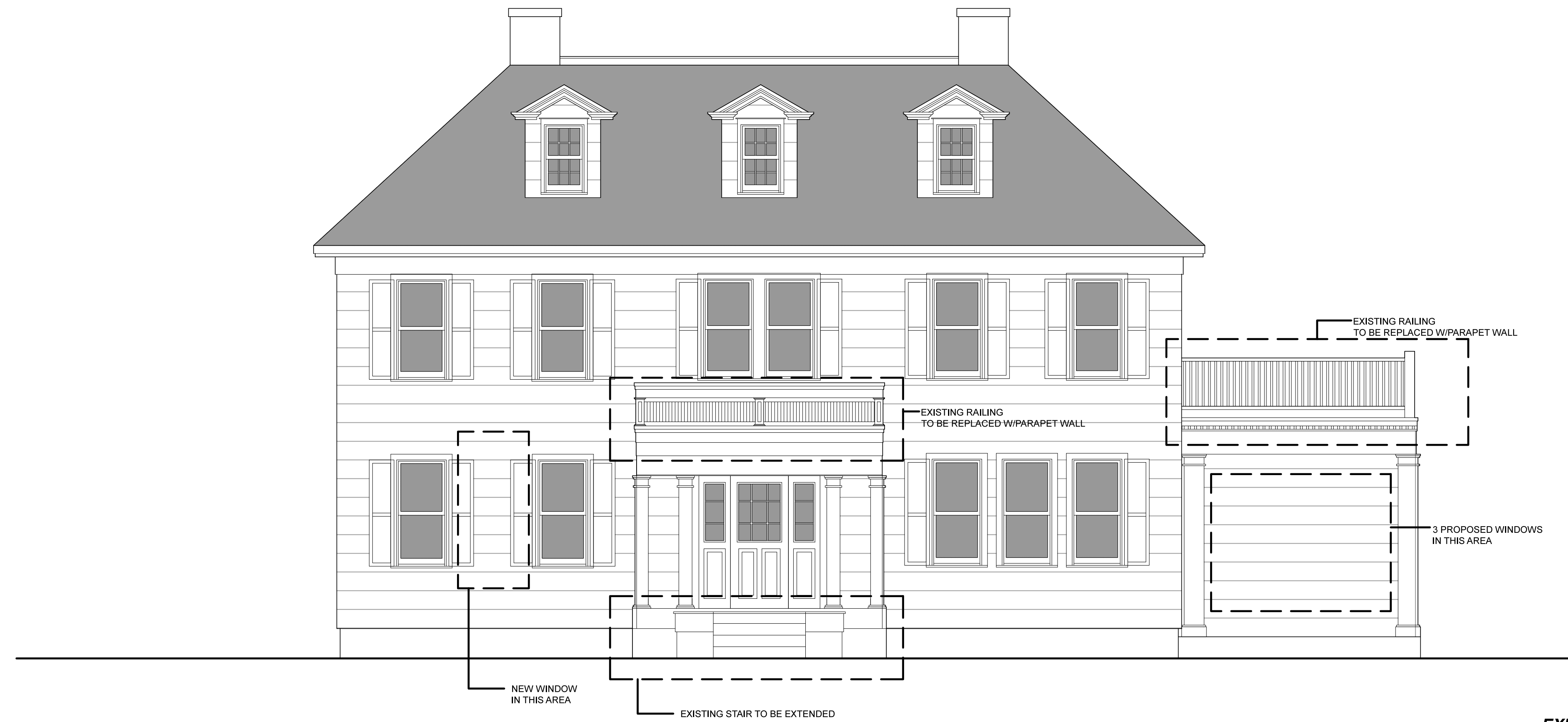
EXISTING SOUTH ELEVATION SCALE: 1/4" = 1'-0"